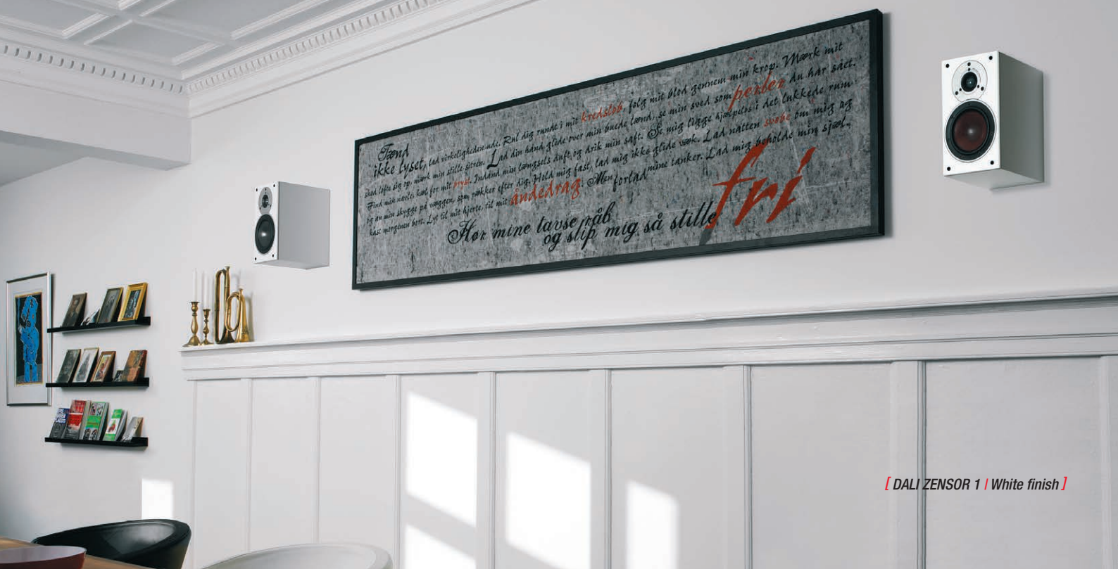
[ DALI ZENSOR 1 | White finish ]