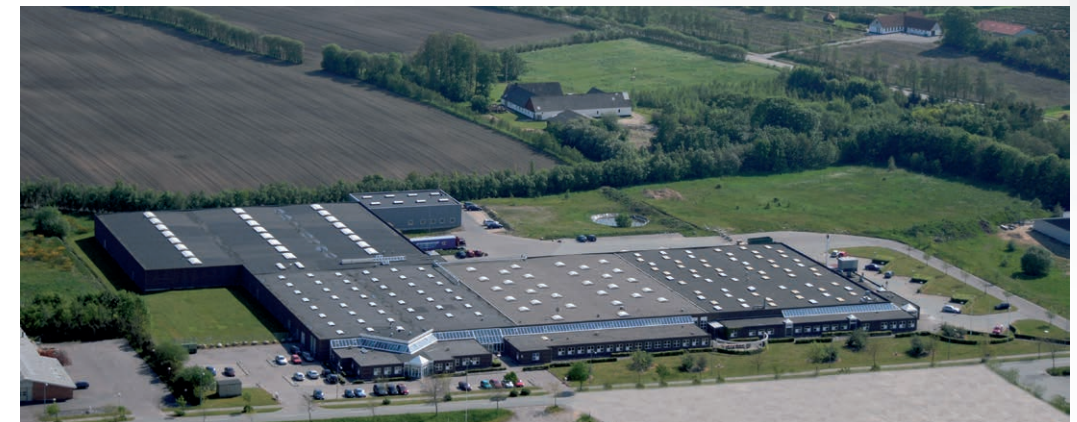
DALI headquarters, Denmark

Hand Crafted | Hand crafted from the fitting of the cabinet to final electroacoustic testing.