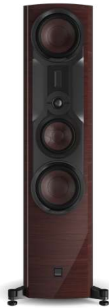
DALI EPIKORE 9