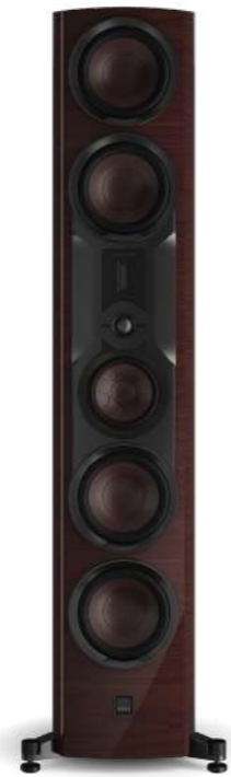
DALI EPIKORE 11