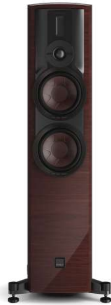
DALI EPIKORE 7