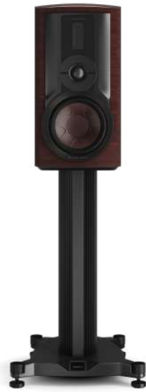
DALI EPIKORE 3 DALI EPIKORE STAND