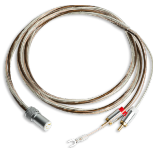
Connect it Phono E 5P/RCA included: Semi-balanced premium phono cable