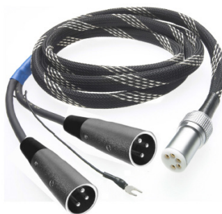
Connect it Phono DS 5P/XLR: separately available upgrade cable for True Balanced phono connections